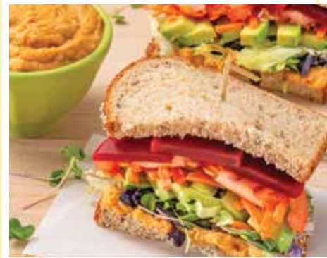
Vegan Rainbow Club Sandwich with Muy Fresco® Mediterranean Hummus