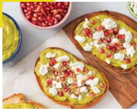
Pomegranate Goat Cheese Avocado Toast with Muy Fresco® Guacamole-Style Dip