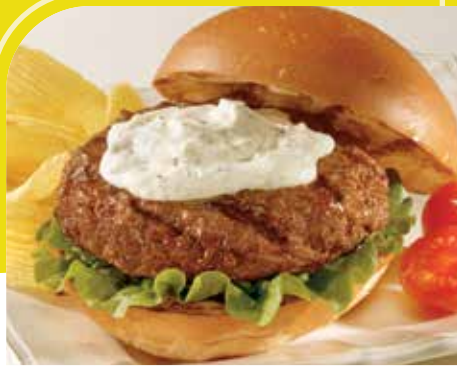
Burger topped with Muy Fresco® Creamy Onion Dip